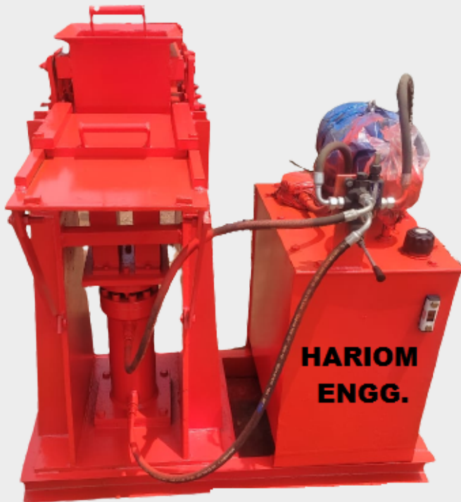
2 cavity Hydraulic Bottom Press Fly ash Brick Machine with Powerpack