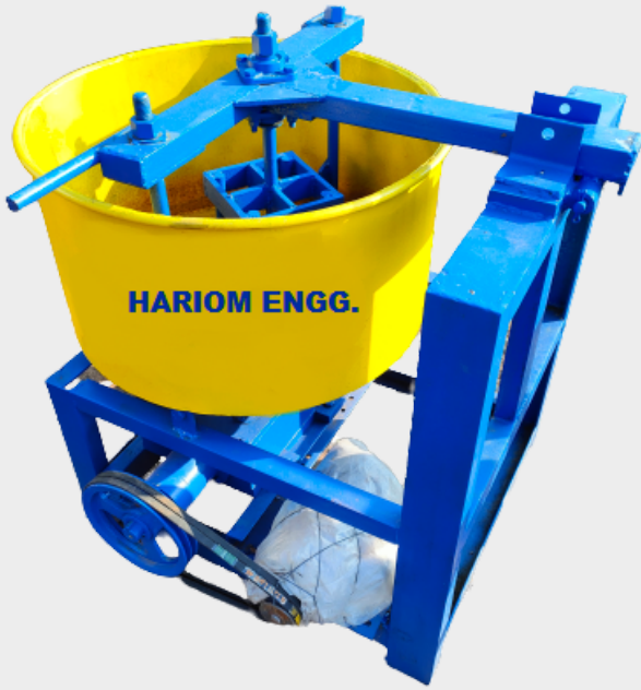
Colour Mixture of 150Kg Capacity with 2HP/ 3HP Crompton Motor